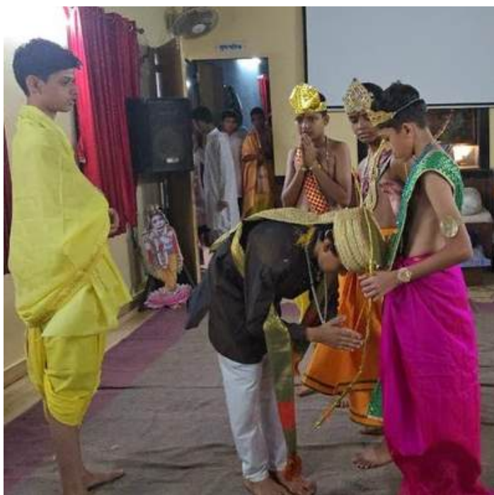
Taking part in Play - Ram Bada Ya Ram ka Naam Bada !