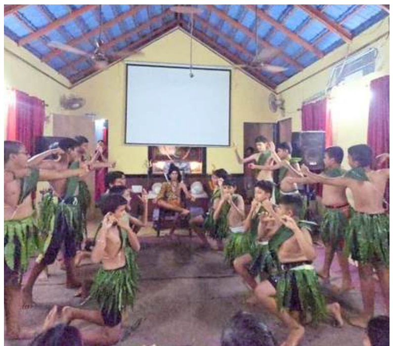
Shiv and his Ganas perform Group Dance