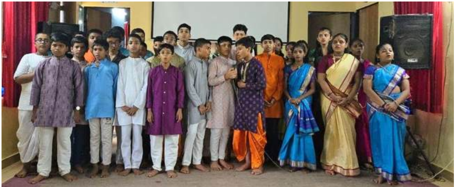
Performing Prayer during Closing Ceremony

From 18 th May to 23 rd May, 2026, DSPPL had organised SOFT 4, 5 and 6 program for children from 12 to 14 years. There were 30 children who participated in the program. All the children enjoyed there stay in the Ashram and learnt very nicely all the subjects like Yog, Agnihotra, Drop it-Catch that, Ancient Science, Communication and Value Education. During the span of 6 days children also performed 3 Dramas and 2 dances and 1 song. All the children are looking forward to come to ashram again.