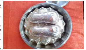
Padukas at Devrukh

The policy of RVN to rotate the Guru Purnima festival gave the honour of celebrations to Baroda. The centre management rose to the occasion with flying colours. The day long celebrations began at 8 am sharp on the morning of 22nd July with 5 Omkars. This was followed with a Rudra Swahakar performed by 5 young sadhaks from Baroda. Thereafter