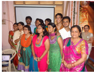
Sadhaks who performed

the sadhaks present created 5 circles representing 5 continents in the world and chanted 5 Omkars. The same circles then sent Reiki to the whole world and prayed for Peace, Harmony, Health and Happiness to everyone.