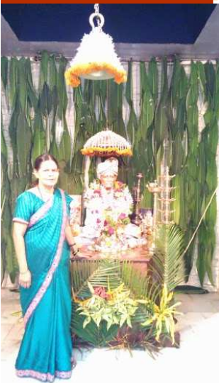
Mai with Swami at devrukh

The policy of RVN to rotate the Guru Purnima festival gave the honour of celebrations to Baroda. The centre management rose to the occasion with flying colours. The day long celebrations began at 8 am sharp on the morning of 22nd July with 5 Omkars. This was followed with a Rudra Swahakar performed by 5 young sadhaks from Baroda. Thereafter