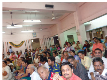
The large gathering at Baroda