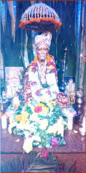
Shri Swami Samarth