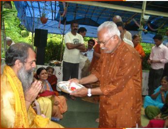
Guru Purnima Celebrations at Devrukh ashram Guruji being offered Aarti

The first American mingled with his pride a singular humility. Spiritual arrogance was foreign to his nature and teachings. He never claimed that the power of articulate speech was proof of superiority over the dumb creation, on the other hand, it is to him a perilous gift. He believes profoundly in silence— the sign of perfect equilibrium. Silence is the absolute poise or balance of the body, mind and the spirit. The man who preserves his self-hood, ever calm and unshaken by the storms of existence— not a leaf, as it were a star on the tree not a ripple upon the surface of shining pool— his, in the mind of the unlettered sage, is the ideal attitude in conduct of life.