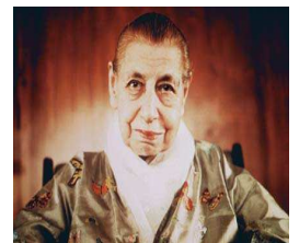
The Mother of Pondichery

The human body has always been in the habit of answering to whatever forces chose to lay hands on it & illness is the price it pays for its inertia & ignorance. It has to learn to answer to the one force alone.