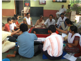
Maha Rudra Swahakar being Performed

of 6th July, 10 Laghurudras were performed. The last Laghu Rudra for completion of Maha Rudra sankalpa was performed on 7th